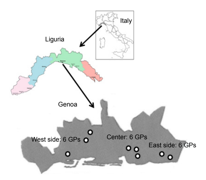
\textbf{Figure 1} \ \ \text{Maps, districts of Genoa and headquarters of outpatient clinics involved} \ \ \text{in the survey.}

With regard to the second survey, once the first survey was completed, a questionnaire was administered to the 18 GPs, working in the same outpatient clinics as the previous survey in order to have a more complete picture of the use of GDs, assuming that GP preferences and medical advice influence patient use. This interview was also conducted in