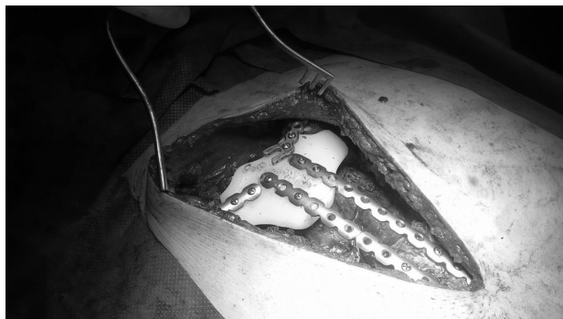
Figure 3 Intraoperative picture: 3D sternal implant filling the defect after tumor resection fixed to bone scaffolds by titanium plates.