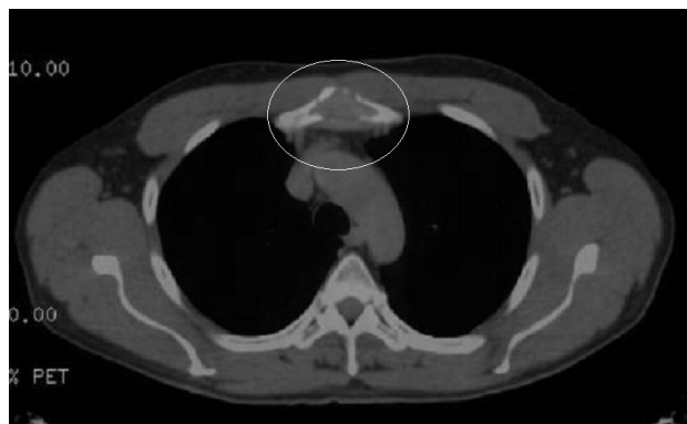
Figure 1 Positron emission tomography-computed tomography examination of metabolically active sternal tumor (white circle: maximum standardized uptake value of fluorine 18 fluorodeoxyglucose = 3.5).

The patient was informed about the purpose of the study, and written informed consent was obtained to have the case