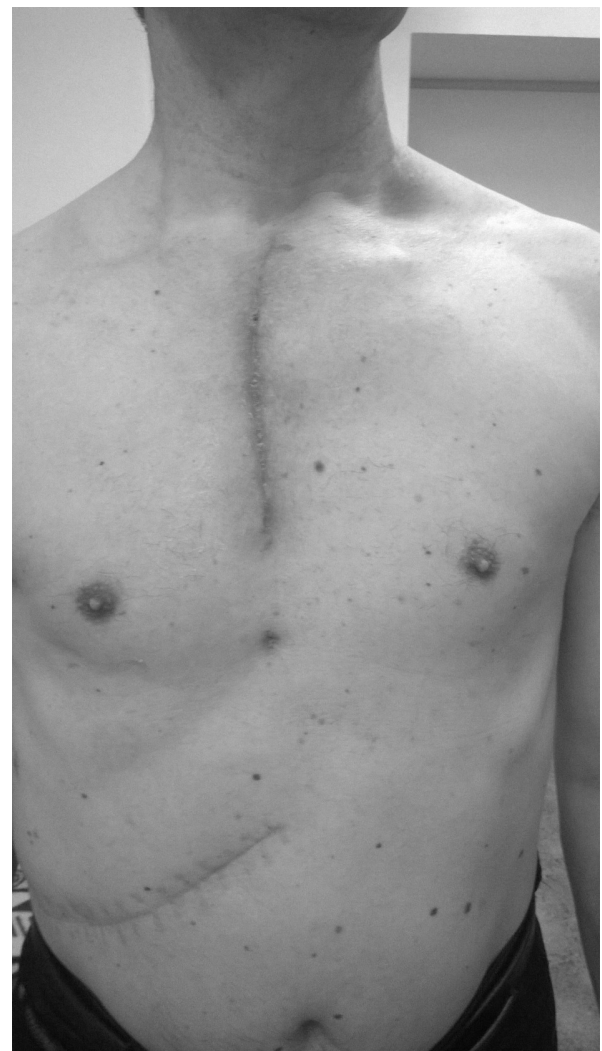
Figure 4 Skin scar 3 months after the operation.

under surveillance of the Thoracosurgical and Orthopedic Outpatient Clinic.