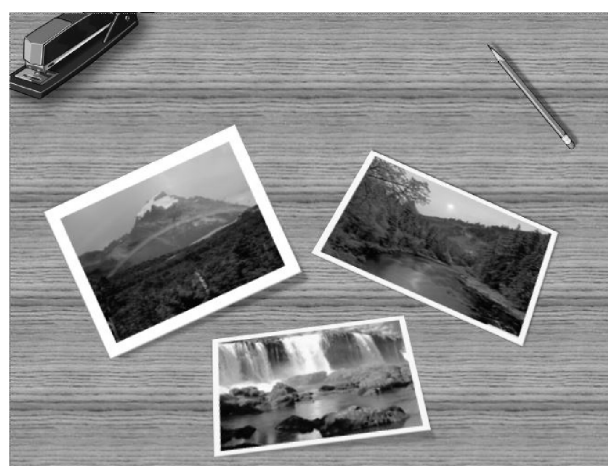
Figure 1 Examples of computerized tasks.