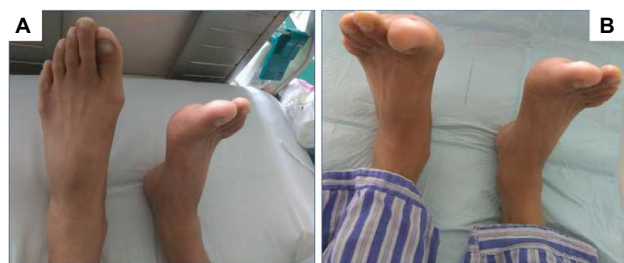
Figure 3 (A) Grade 1 preoperative anterior tibial muscle strength of the left lower extremity. (B) Grade 4 anterior tibial muscle strength of the left lower extremity immediately after the surgery.