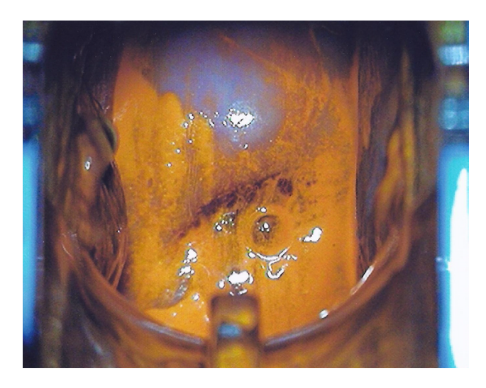
Figure 3 Intravaginal curcumin on the cervix.