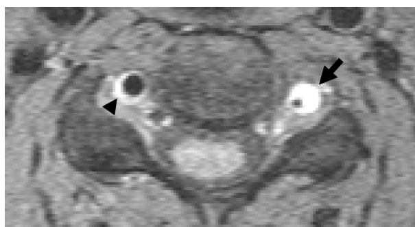
Figure 4 The axial fat-saturated T1 MRI sequence shows dissection of the left (arrow) and dissection of the right VA (arrow head).

Our report of isolated pain in the neck as the sole symptom of spontaneous bilateral VA dissection has two clinically relevant implications. First, the absence of any neurological symptoms in our patient highlights the necessity of considering cervical artery dissection in patients presenting with unspecific symptoms such as neck pain, even if isolated. 3 Second, our image of intramural hematoma on duplex