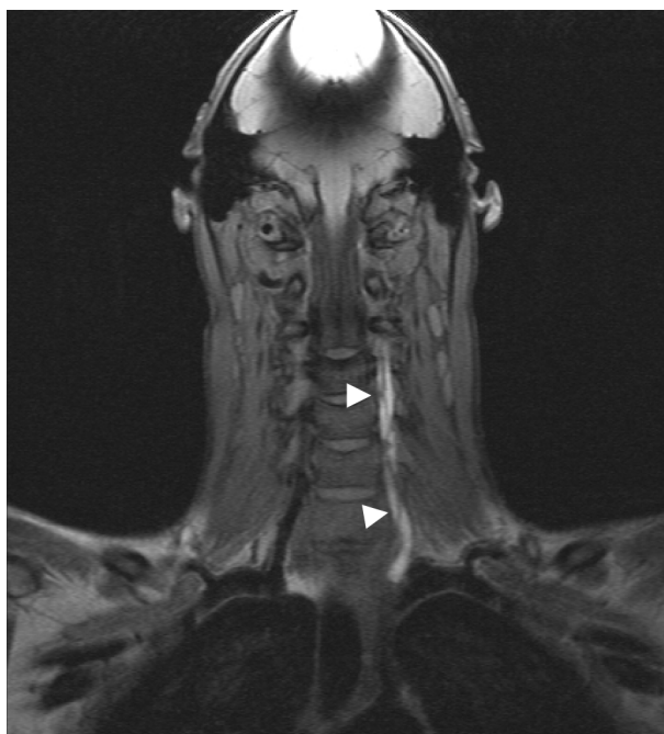
Figure 3 The coronal fat-saturated T1-weighted MRI sequence shows dissection of the left VA (arrow heads).

Abbreviations: MRI, magnetic resonance imaging; VA, vertebral artery.