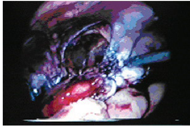
Figure 3 Tubularized Boari flap being anastomosed to the ureter.

the anterior surface of the bladder. The flap was converted into a tube and the lower end of the ureter was anastomosed to the end of the Boari flap tube. No attempt was made to create a submucosal tunnel antireflux technique. A 6-Fr DJ stent was placed and the bladder closed. Total operating time was 160 minutes. Urine output rose to 3400 cc in the first 24 hrs, serum creatinine came down to 0.9 mg% within 48 hrs, and ultrasound revealed no more hydronephrosis. No intra- or postoperative complications were noted. Postoperative paralytic ileus was noted for 96 hrs and conservatively managed.