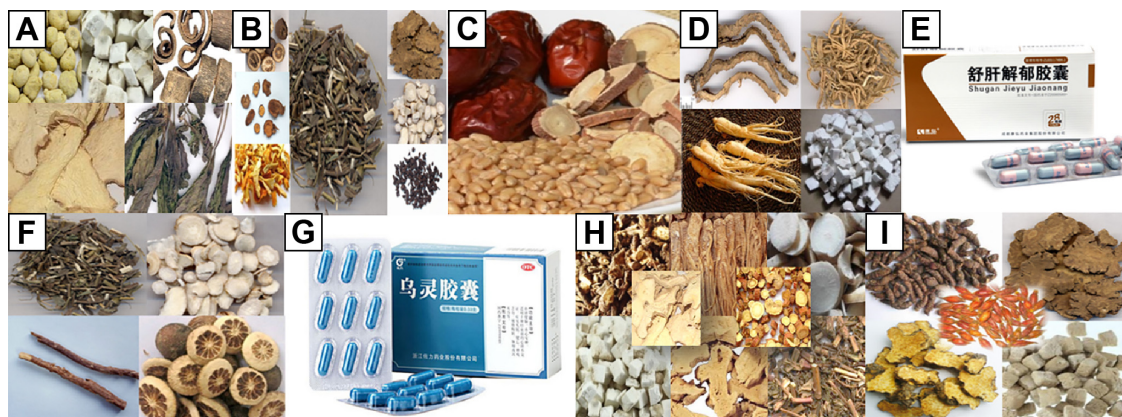
Figure 1 The nine formulas examined in this review.

suye were the core herb pairs to alleviate depression-like serotonergic and dopaminergic changes in mice. 33 Furthermore, aqueous and lipophilic extracts of BHD showed the greatest antidepressant effects, whereas the polyphenol fraction showed a moderate effect. 22 BHD reduced immobility time in the forced-swim test (FST) and tail-suspension test (TST), increased 5-HT and 5-hydroxyindoleacetic acid levels in the hippocampus and striatum, and decreased serum and liver malondialdehyde (MDA) levels in mice with a depression-like phenotype. 34 Ethanol and water extracts of BHD reduced c-Fos expression in cerebral regions of rats subjected to chronic mild stress (CMS) to a level comparable to that of fluoxetine. 35 BHD significantly