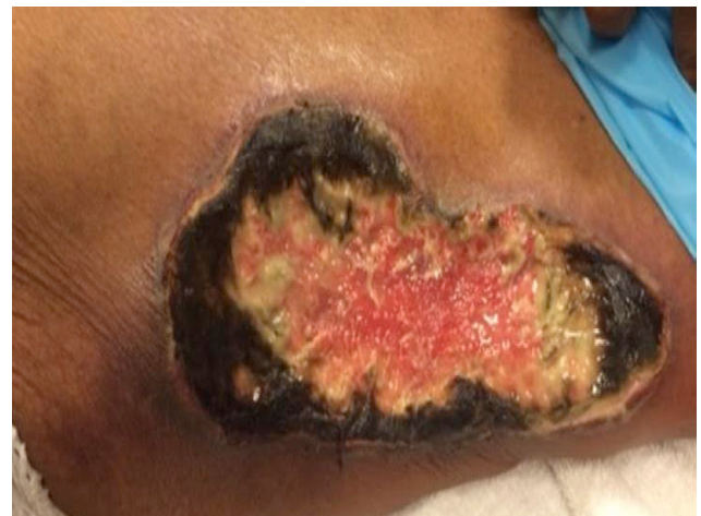
Figure 1 A representative image showing an ulcerated calciophylaxis lesion with black eschar in a peritoneal dialysis patient.

As summarized in Table 2, PD patients who developed calciophylaxis were more likely to be female (71% vs 30%, P=0.032 ) and had higher frequencies of obesity (57% vs 20%, P=0.031 ), prior history of being on HD (71% vs 30%, P=0.032 ), prior episodes of recurrent hypotension (43% vs 7%, P=0.004 ), and warfarin therapy exposure (71% vs 16%, P=0.001 ). Review of echocardiographic data from calciophylaxis PD patients with recurrent episodes of hypotension showed that all of these patients had symmetric left ventricular hypertrophy and reduced left ventricular ejection fraction (range: 20–32%). Calciophylaxis patients had