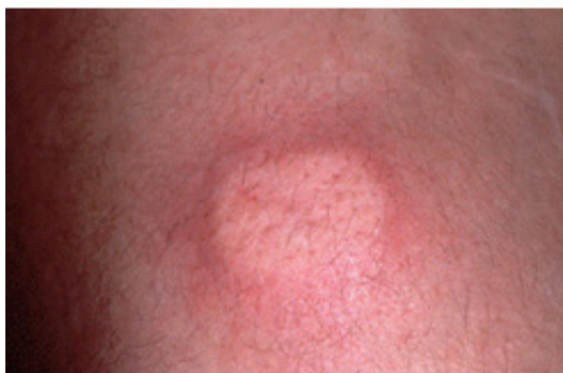
Figure 1 Injection-site reactions following SCIg therapy. Examples of injection-site reactions that were classified as mild and moderate are shown.