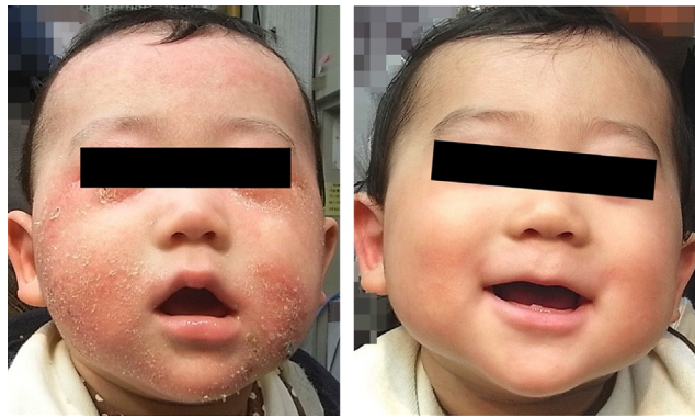
Figure 2 An infant with moderately severe atopic dermatitis (left).

Note: The patient did not use TCS and 4 months later was assessed as being in remission.