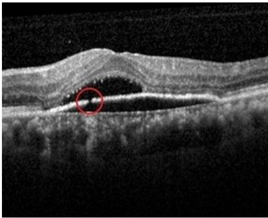
Figure 2 RPE discontinuity and subretinal fluid. Note: Area of discontinuity shown in the red circle. Abbreviation: RPE, retinal pigment epithelium.

18.0; SPSS Inc., Chicago, IL, USA). Independent samples t -test was used to compare the structural and functional outcomes and number of injections between the different groups. P -values <0.05 were considered statistically significant.