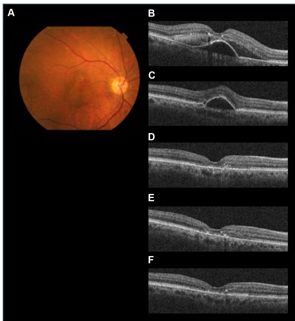
Figure 2 The efficacy of aflibercept for AMD refractory to ranibizumab (patient 8 with PCV).

Notes: A fundus photograph at baseline (A) and SD-OCT images prior to the initial IVR injection (B), at baseline (C), 1 month after the initial IVA injection (D), 3 months after the initial IVA injection (E), and 12 months after the initial IVA injection (F) in a 72-year-old man with PCV are shown. Slight SRF and prominent subfoveal PED have resolved completely at 1-month follow-up examination, and the improved anatomic condition has been maintained over 12 months.