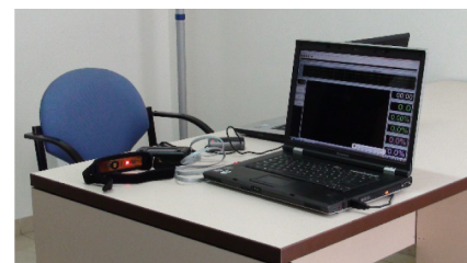
Figure 1 HEG device. Abbreviation: HEG, hemoencephalography.

Evaluation was made individually for each subject by a single researcher, and always the same researcher, in an isolated and properly conditioned room. The brain activity was recorded at the Fpz electroencephalographic point. At the beginning, a 30-second HEG record was registered to establish the baseline (minimal mental activity). To do this, each subject was asked to close his eyes and visualize the number 1, thus obtaining a homogeneous baseline measurement in all study subjects.