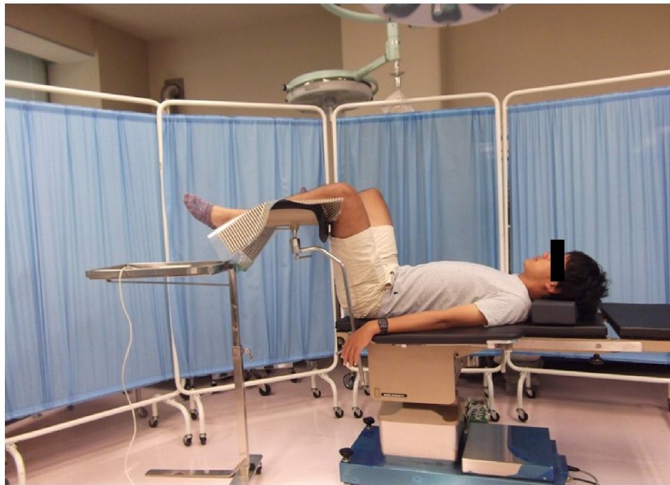
Figure 1 Lithotomy position.

Note: The subject's left knee and lower leg were placed on a BIG-MAT2000P3BS® sheet spread over a Knee Crutch®.