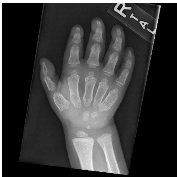
Figure 2 X-ray of the hand demonstrating the typical radiographic findings in patients with Hunter syndrome. The small density over the proximal hypothenar eminence in this image represents a foreign body.

Progressive neurologic deterioration characterizes the severe phenotypes of MPS II with slow global acquisition of developmental milestones during the preschool years. Behavior problems, particularly aggressiveness and hyperactivity, may be significant and quite taxing on care givers