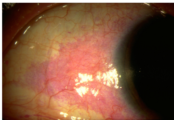
Figure 2 Ocular surface of a dry eye patient following Rose Bengal application. Notes: Purple stained areas indicate devitalized tissue and epithelial cell damage.

Other tests that may be performed include functional visual acuity and observation of the tear meniscus (tear lake). Functional visual acuity is a measure of visual acuity related to specific daily visual tasks, since patients with dry eye report decreased visual acuity during prolonged concentration on visual tasks such as reading, driving, or working at a computer. Unfortunately, testing of functional visual acuity is subjective and time-consuming.