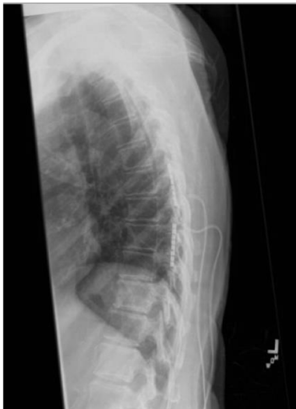
Figure 2 Lateral thoracic X-ray image showing permanent paddle lead placement in the thoracic interspaces.

Written informed consent was obtained from our patient for publication of this case report and any accompanying images. Institutional Review Board was not needed