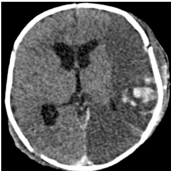
Figure 1 Post craniotomy axial CT shows extensive hypodensity involving the gray and white matter of the left hemisphere with bleeding foci. Midline shift and uncal herniation is also seen.

In view of the ceftriaxone therapy, the picture of biliary sludge suggested ceftriaxone-associated pseudolithiasis. Ceftriaxone was discontinued on the following day, after a total therapy that lasted 3 days. At this time, the ursodeoxycholic acid was administered to the child at a dose of 15 mg/kg twice a day and fat-soluble vitamins as supplementary therapy.