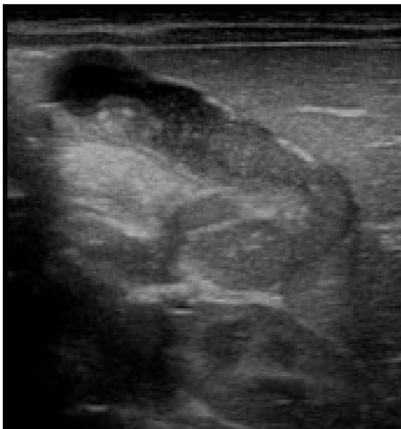
Figure 3 The gallbladder after 2 weeks of treatment – partial and gradual improvement.

Hyperbilirubinemia is an important contraindication to administration of ceftriaxone in neonates, especially preterm newborns, because of the displacement of bilirubin from albumin-binding sites and an increase in serum concentrations of free bilirubin. However, risk factors for biliary