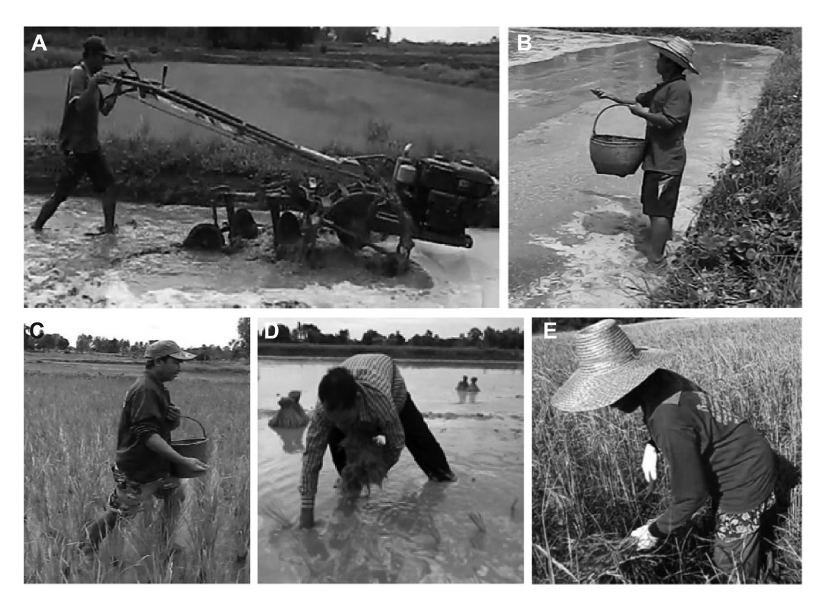
Figure 1 Typical rice cultivation processes including: (A) plowing; (B) seeding: (C) nursing and fertilizing; (D) planting; and (E) harvesting.

Females are generally exposed to a higher risk of lower extremity malalignment due to different anatomical alignment, lower pain thresholds, and lower physical tolerance than males.<sup>17–20</sup> Previous studies found that females are at increased risk of abnormal anterior pelvic tilt, femoral antetorsion, Q angle, tibiofemoral malalignment, and genu recurvatum.<sup>17,18</sup> However, the sex difference for limb