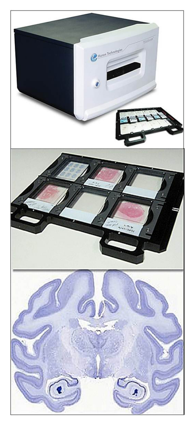
Figure 2 (Top) Huron TISSUEscope scanner that is capable of digitizing a variety of slides ranging from regular 3'' \times 1'' (75 mm \times 25 mm) glass slides to (Middle) glass slides as large as 8'' \times 6'' (200 mm \times 150 mm) (whole slide imaging). (Bottom) Digital whole mount brain image.

WSI scanners (Figure 2) designed to scan whole mount glass slides (eg, 8'' \times 6'' slides, such as brain or complete prostate gland sections). It is important to note that some glass slides (eg, very thick or broken slides) may fail automated scanning and may need to be reloaded more than once to allow