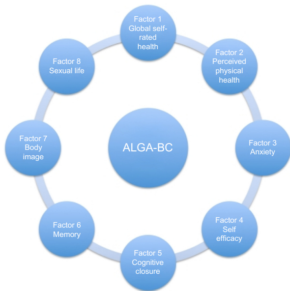
Figure 2 The eight factors included in the ALGA-Breast Cancer (ALGA-BC) questionnaire.

Next, scores were calculated for each participant by summing the item scores identified for each factor and dividing by the total number of items.