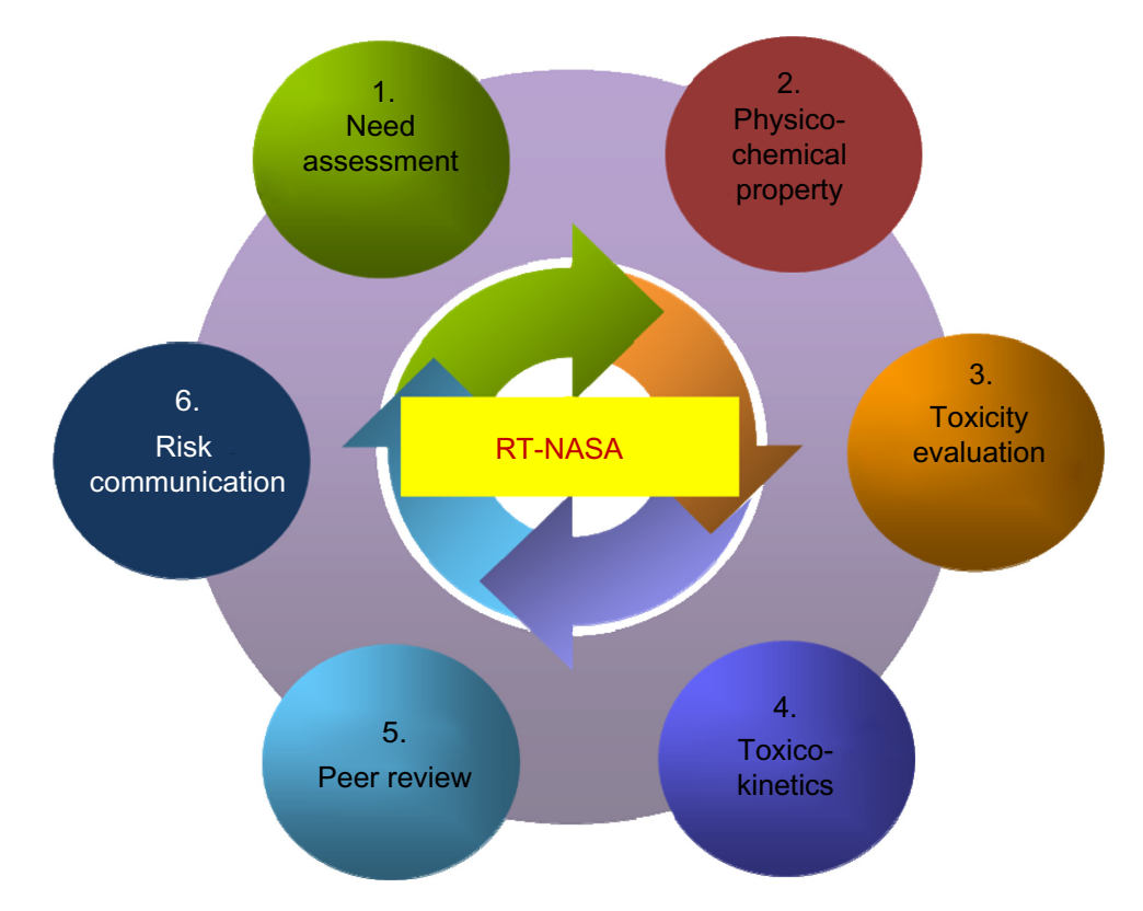
Figure 2 Six functional steps of the nanosafety process established by the Research Team for Nano-Associated Safety Assessment (RT-NASA).

In order to assess the level of consumer awareness, we analyzed their responses in addressing knowledge of and encounters with NPs, based on sex, age, level of education, and average monthly household income. Analyses of the results indicated no significant difference in the responses by sex, age, and level of education. However, significant differences in the responses were observed from average monthly household income. Moreover, when we compared the awareness of nanotechnology between consumers and experts, we found that consumers had a more positive attitude toward nanotechnology and its application although they had lower awareness of it than the expert group. Therefore, we suggest that a communication system, including educational and promotional programming, should be established to address consumer expectations and concerns.