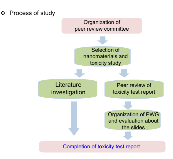
Figure 3 The entire system and research direction for the establishment of reliable nanotoxicity data.

After organizing the peer review committee, NP toxicity studies were collected and evaluated for review by a multistep process. First, the committee searched and collected references on NPs in three different categories: physicochemical properties, in vitro toxicokinetic studies, and in vivo toxicokinetic studies. The Korea Testing and Research Institute and executive office then wrote a toxicity test report, which was circulated to each member of the committee. The report on toxicity studies of ZnO and SiO<sub>2</sub> NPs was evaluated