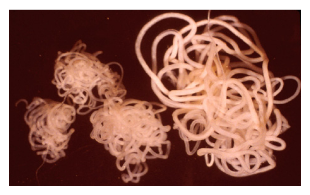
Figure I Onchocerca volvulus filarial parasites (three adult males and one adult female).