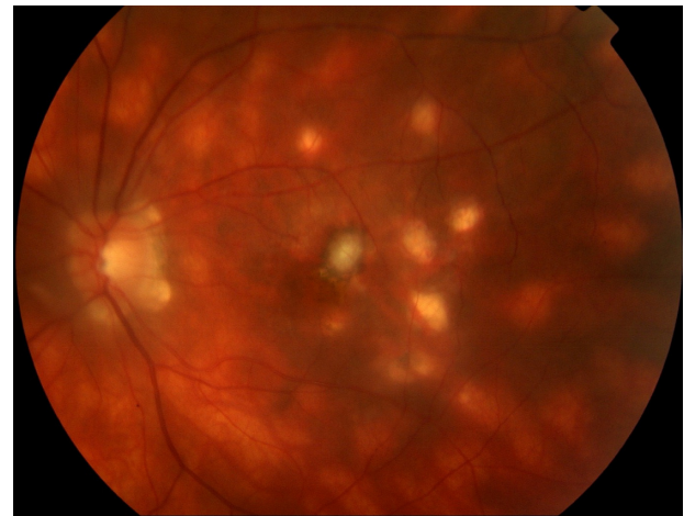
Figure 2 A patient with long-standing birdshot chorioretinopathy who developed a central choroidal neovascular membrane associated with a dramatic drop in visual acuity.

Fundus fluorescein angiography remains the gold-standard assessment of the integrity of the retinal vasculature, but it has relatively low specificity in characterizing birdshot lesions,