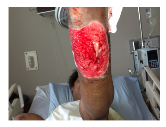
Figure 2 Patient's vascular lesions in the forearm after being cured by enterostomal care.

width = 19%), and platelets of 183 × 10³ uL. Her differential showed 75% neutrophils, 20% lymphocytes, 2% monocytes, and bands of 2% with an absolute neutrophil count of 3,465 cells/mm³. Urinalysis came with proteinuria (150 mg/dL), occult blood (250 uL), red blood cells (loaded – not countable/high power field), and many amorphous crystals. The punch biopsy of her ear showed superficial thrombosis of superficial vascular plexus with perivascular lymphocytic infiltrates and deeper sections showed epidermal necrosis and necrotizing vasculitis (Figure 3). Cultures of the ulcers came back with no organism growth. Also, blood cultures and urine culture were negative for an infective organism. This patient was started on a high dose of steroids, but didn't finish treatment since she escaped from the hospital.