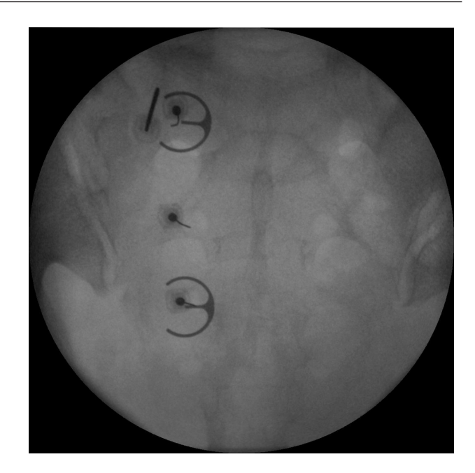
Figure 2 Anteroposterior fluoroscopic view of the sacrum showing three separate 25-gauge spinal needles placed within the left S1, S2, and S3 foramina. An epsilon ruler is used as a guide such that the needle tip is positioned about 10 mm lateral to the posterior sacral foramina apertures. The radiofrequency electrode is positioned at the 11 o'clock position of the S1 foramen.

was superficially suspended approximately 2 mm off the sacral bony surface. At each of the respective target positions, impedance within the range of 200–500 ohms and baseline temperature readings were obtained. Once the position was verified, 1 mL of 0.25% bupivacaine and 5 mg of triamcinolone were injected at each lesion site. Radiofrequency lesioning was then carried out at a set temperature of 60°C for 150 seconds.<sup>9</sup> Subsequently, the introducer and electrode were repositioned caudally in a stepwise manner to create two additional lesions along the lateral aspect of S1 as well as lesions lateral to the S2 and S3 posterior sacral foraminal apertures.