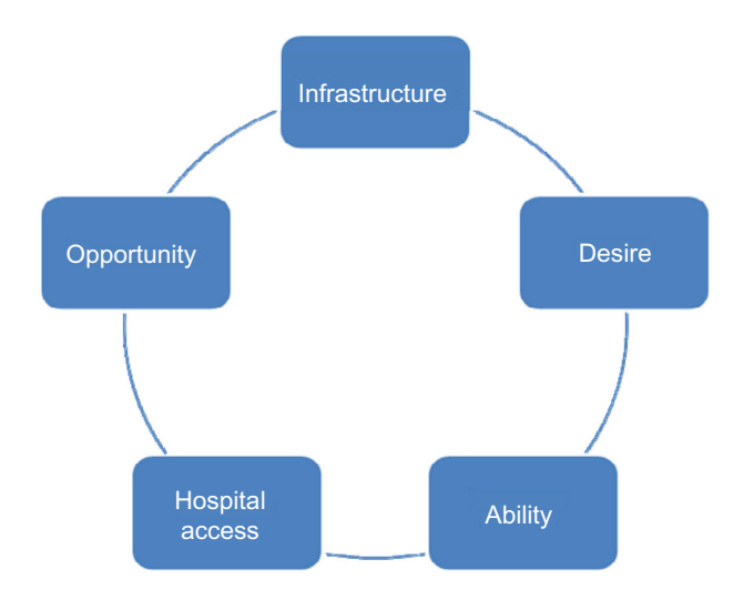
Figure I The IDAHO criteria.

In response to the limitations of predicting outcomes using current classification systems, assessment tools, and scales, we devised a concise collection of a small number of variables, which we have found to influence function in individuals experiencing spasticity, and developed the IDAHO Criteria (Figure 1). It is similar in concept to the World Health Organization's International Classification of Functioning, Disability and Health (ICF),<sup>18</sup> which is formidable and rarely used clinically or otherwise.<sup>19</sup> The ICF is exhaustively detailed in compiling factors to measure health and disability, and serves as a valuable research tool. The IDAHO Criteria offers a simple alternative schematic to assist in evaluating an individual's potential. This model guides goal setting, and recognizes the importance of many factors integral to attaining functional improvement; treatment options are evaluated holistically for optimal outcomes. Approaches that consider the processes involved with health care delivery have demonstrated improved patient and family satisfaction.<sup>20,21</sup>