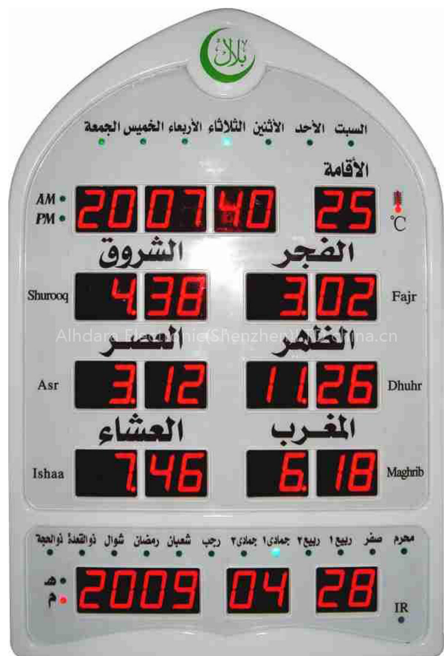
Figure 2 Electronic clocks have been used recently in mosques to determine prayer times.

sleep or doze off, His creations, including mankind, need sleep every day.