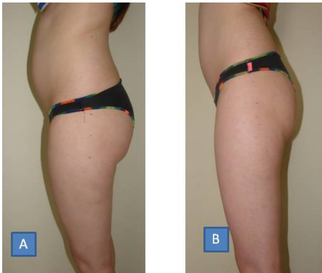
Figure 2A and 2B. Pretreatment and post-treatment 5 cm and 10 cm below the navel.

The three conditions, ie, edema, cellulite, and obesity, can occur simultaneously. However, the treatment should be specific for each condition; if not, the objective of treatment will not be reached. This association of conditions leads to increases in alterations of subcutaneous tissue, and so has a synergic effect, both to aggravate the symptoms and improve