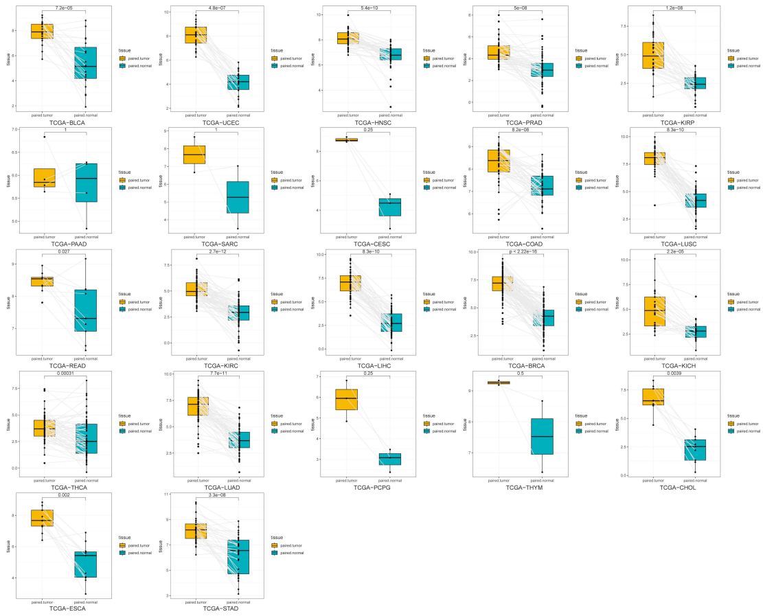
Supplementary Figure S1 The complete findings on CDKN3 expression in corresponding tumors and normal tissues.