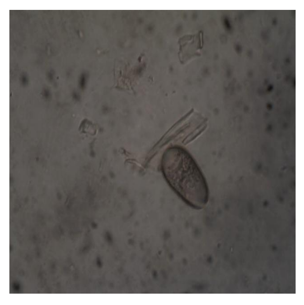
Unsporulated Eimera oocysts from cattle