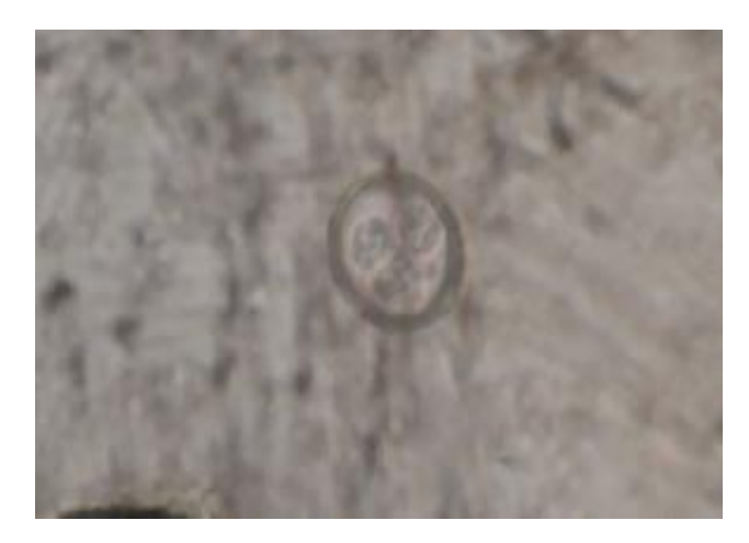
Sporulated Eimera oocysts from cattle