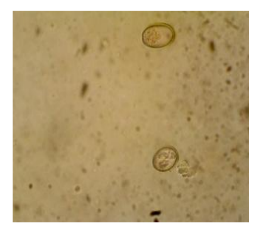
Sporulated Eimera oocyst from sheep