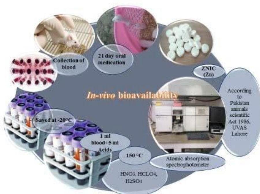
Figure S2: In-vivo study as additionally material.