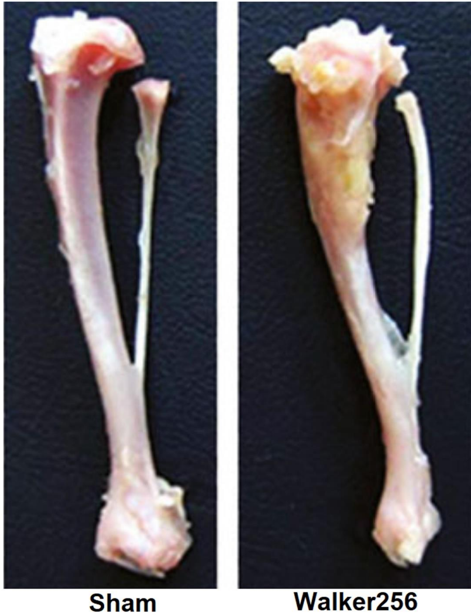
Supplementary Figure 2. Tibia bone from normal and tumor bearing rats 14 days after Walker 256 inoculation.