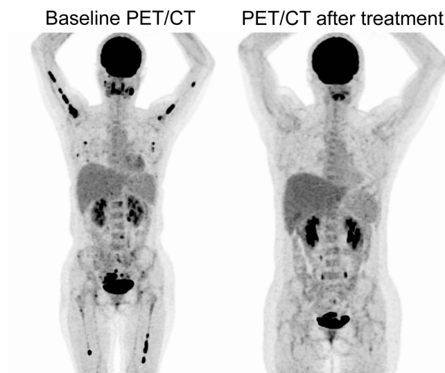
Figure 2 ^{18}\text{F} -FDG PET/CT imaging after and before treatment.