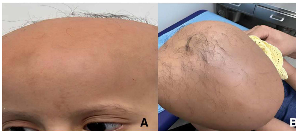
Figure 1 Diffuse alopecia with few terminal hairs. (A) Frontal view, (B) Vertex view.