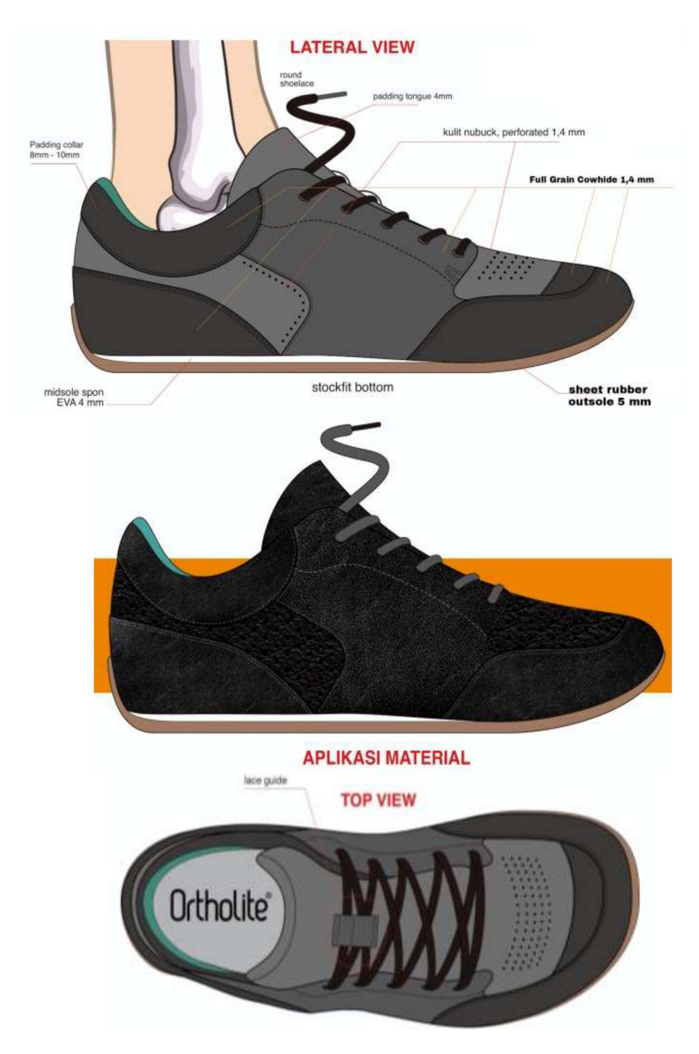
Figure 2 Individual anthropometry shoe design.