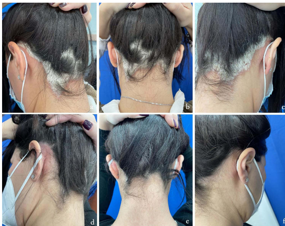
Figure 1 Scalp psoriasis in patient 3 at baseline (a–c) and after 12 weeks of treatment (d–f).