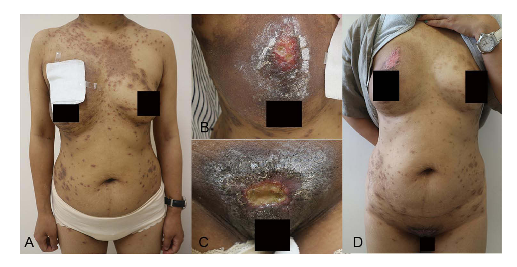
Figure 2 Clinical manifestations in a 38-year-old female with PG and eczema. Scattered ulcers with a small amount of pus on the surface were seen on the right chest and vulva. The ulcers were surrounded by erythema and hyperpigmentation. There were scattered erythema, claw marks, and crusts on the trunk. (A–C) and after 4 months of treatment with baricitinib. Pinkish scarring was seen on the right breast and vulva. There was scattered pigmentation on the trunk. (D).

vessel wall and overflow of large red blood cells (Figure 1F–H). PG should be considered combined with the patient's clinical manifestations and examination after mycobacterial and fungal infections have been ruled out.