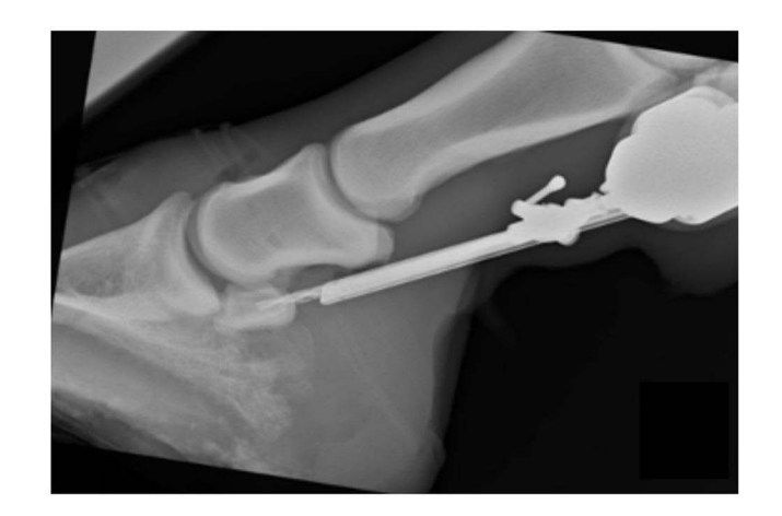
Figure 3 Ideal positioning of drill-bit over the proximal osseous portion of the navicular bone.

Some difficulties associated with the core osteostixis procedure may exist related to anatomical variations in the proximal margin of the navicular bone encountered during surgery. A case in point is Horse 2, which was the only participant in the study that had a higher lameness score at 24 weeks after surgery in the limb that had undergone core osteostixis as compared to the bursoscopy-only limb (Table 5). This horse was the first encountered in this study having a convex shape to the proximal border of its navicular bone, which made it more difficult for the surgeon to direct the drill bit to enter the medullary cavity of the bone as occurred in the other horses (Figure 3). In Horse 2, multiple attempts were made to enter the medullary cavity, and the drill bit inadvertently entered the navicular bursa and distal interphalangeal joint. Given these difficulties, we believe that it is imperative that the drill guide be seated directly over the proximal osseous part of the navicular bone with no soft tissue separating the drill guide from the bone. In other