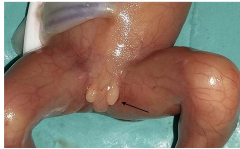
Figure 3 Hypospadias with the bifid scrotum in the fetus with a deletion 13q31.1q34 (case number 2 in Table 1).

similar rather to those of trisomy 13. Abnormal cerebral anatomy, with symptoms of holoprosencephaly, was diagnosed at the 11th week of gestation. A follow-up ultrasound at the 17th week of pregnancy showed a unilateral facial cleft, holoprosencephaly with Dandy-Walker malformation, and abnormal positioning of feet and knees. On autopsy, dysmorphic facial features including unilateral cleft lip and palate, low-set implantation of the ears, hypertelorism, and neck edema were diagnosed. Vervecken et al reported also upper and lower limb abnormalities, e.g. the right thumb was absent, the left was only rudimentary. 11 In our study group, we also found a smaller 13q deletion (2,17 Mb) covering the 13q34 region. The aberration was classified as potentially pathogenic copy number variation. The indication for invasive diagnosis was a high risk of trisomy 21 in the combined test. In the second trimester, the only abnormality was a right-sided choroid plexus cyst. Due to the potential pathogenic nature of the lesion and the almost normal ultrasound image of the fetus, the prognosis was very difficult to determine.