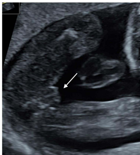
Figure 2 The female appearance of the external genitalia in a fetal ultrasound examination with a deletion 13q31.1q34 (case number 2 in Table 1).

Deletions on the long arm of chromosome 13 have been described in patients with mental retardation, facial anomalies (flattened nasal bridge, hypertelorism, microcephaly, and micrognathia), and severe malformations in the central nervous system, distal limbs, genitourinary tract, and congenital heart defects. 2 We diagnosed twin monozygotic pregnancy with a large deletion (30,4 Mb) in region 13q31.1q34. Ultrasound examination at the 12th week of pregnancy revealed the increased nuchal translucency in both fetuses and an increased risk of Down syndrome in the combined test. In the second trimester, we recognised ventriculomegaly, agenesis of the corpus callosum, hypospadias with the bifid scrotum, increased nuchal fold, flat profile, and shortening of the nasal bones in both twins with the 13q31.1-q34 deletion (Figures 2 and 3). Additionally, one of the twins had a right aortic arch. The second twin had normal heart anatomy, but there was an effusion to a pericardial sac. Wang et al observed that congenital heart disease, anorectal/genitourinary, and gastrointestinal tract malformations are the prominent anomalies observed in 13q deletion syndrome. 10 Vervecken et al presented a prenatal case with the same deletion as our case (deletion 13q31.1-q34), but the phenotypic features were