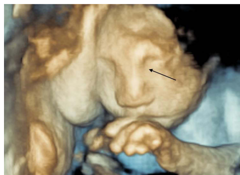
Figure 4 Facial dysmorphism in the fetus with mosaic monosomy of chromosome 13 with a marker chromosome (case number 4 in Table 1).