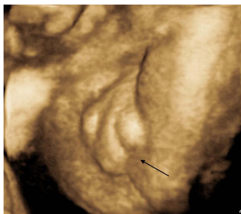
Figure 5 Hypospadias with the bifid scrotum in the fetus with mosaic monosomy of chromosome 13 with a marker chromosome (case number 4 in Table 1).

We reported a case with mosaic trisomy 13 with no malformations in the first and in the second trimester. The only abnormalities in our case were tachycardia and low levels of PAPP-A and BhCG in the maternal blood. The risk for Patau syndrome was increased. Amniocentesis was performed at the 15th week of pregnancy and the karyotype was mosaic \text{mos } 47,XX,+13[11]/46,XX[10] . Parents refused to follow up. Chen et al presented a case with mosaic trisomy 13 without malformations. The neonate was doing well and presented neither phenotypic abnormalities nor psychomotor disorders at two months. 13 Individuals with mosaic trisomy 13 have been reported to present phenotypic variability from the normal phenotype to the abnormal phenotype of trisomy 13. 13 Griffith et al showed no clear correlation between the percentage of trisomic cells and the level of intellectual function. The features of dysmorphism vary significantly from patient to patient, which makes the clinical diagnosis of trisomy 13 mosaicism difficult. 14