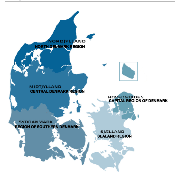
Figure 1. The five regions of Denmark formed by the 2007 municipal reform

Note: a English names are given according to Danish Regions.5