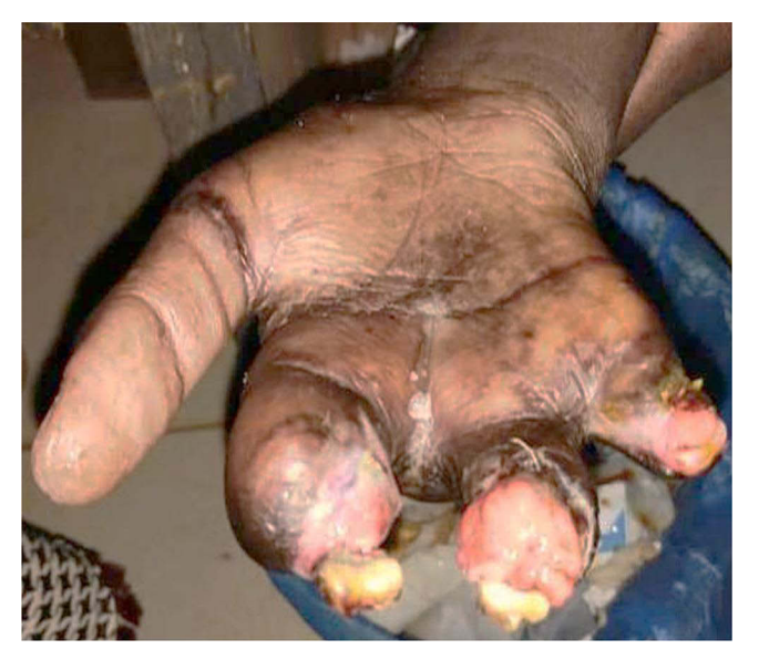
Figure 1 Right hand of the patient post middle finger amputation, demonstrating extensive digital ulceration.

Hand x-ray shows reduced bone density at the distal end of the radius and ulna, carpal bone, and metacarpophalangeal joint with a fracture in the index and ring fingers and an amputated middle finger (Figure 2).