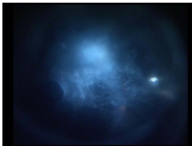
Figure 1 Diffuse vitreous opacification illuminated intraoperatively.