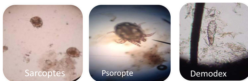
Figure 1 Mange mite genera.

3.13% prevalence of mange mite in and around Hawassa, southern Ethiopia. The variations might be due to the difference in the weather conditions, inadequate veterinary service and types of management practiced in the study areas.