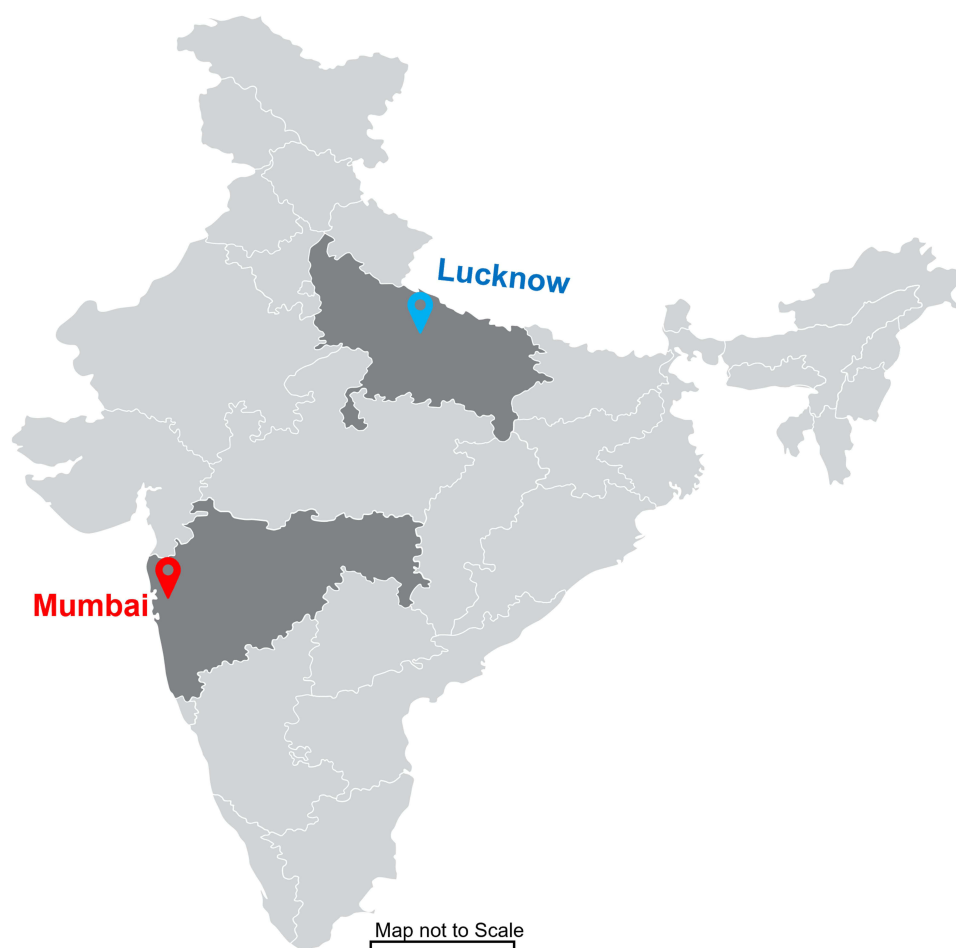
Figure 1 Geospatial Map of India indicating the location of two areas from where the clinical strains of M. tuberculosis have been obtained.