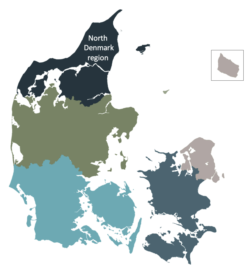
\textbf{Figure I} \ \, \textbf{A} \ \, \text{map of the Denmark.} \ \, \textbf{The North Denmark Region is marked with black.}

Medical care is tax-supported and free of charge for all residents in Denmark. A unique civil registration number is assigned at birth, which allows for a unique identification of all Danish residents and an unambiguous linkage of individuals between registries. In the North Denmark Region, an outpatient clinic for patients with long-COVID was established on January 1, 2021 at Aalborg University Hospital (Figure 1). The catchment population was 590,439 (January 1, 2021) and 21,727 had tested positive for SARS-CoV-2 in the North Denmark Region during the study period. Patients eligible for consultation at the hospital outpatient clinic were required to have had symptoms for >6 weeks and a previous SARS-CoV-2 infection documented by a positive polymerase chain reaction (PCR) test on a respiratory sample or a positive serum antibody test. In addition, all patients admitted with acute COVID-19 infection requiring oxygen treatment were invited to a follow-up examination at Aalborg University Hospital.