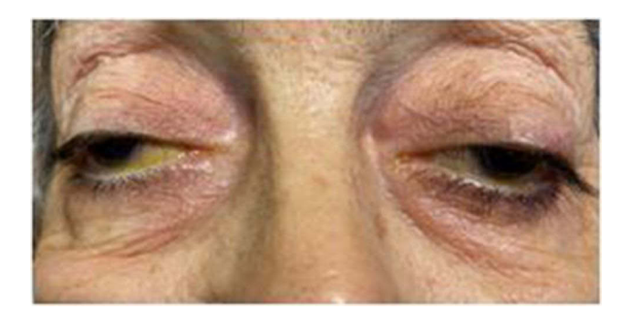
Figure I Bilateral ptosis and facial atrophy.