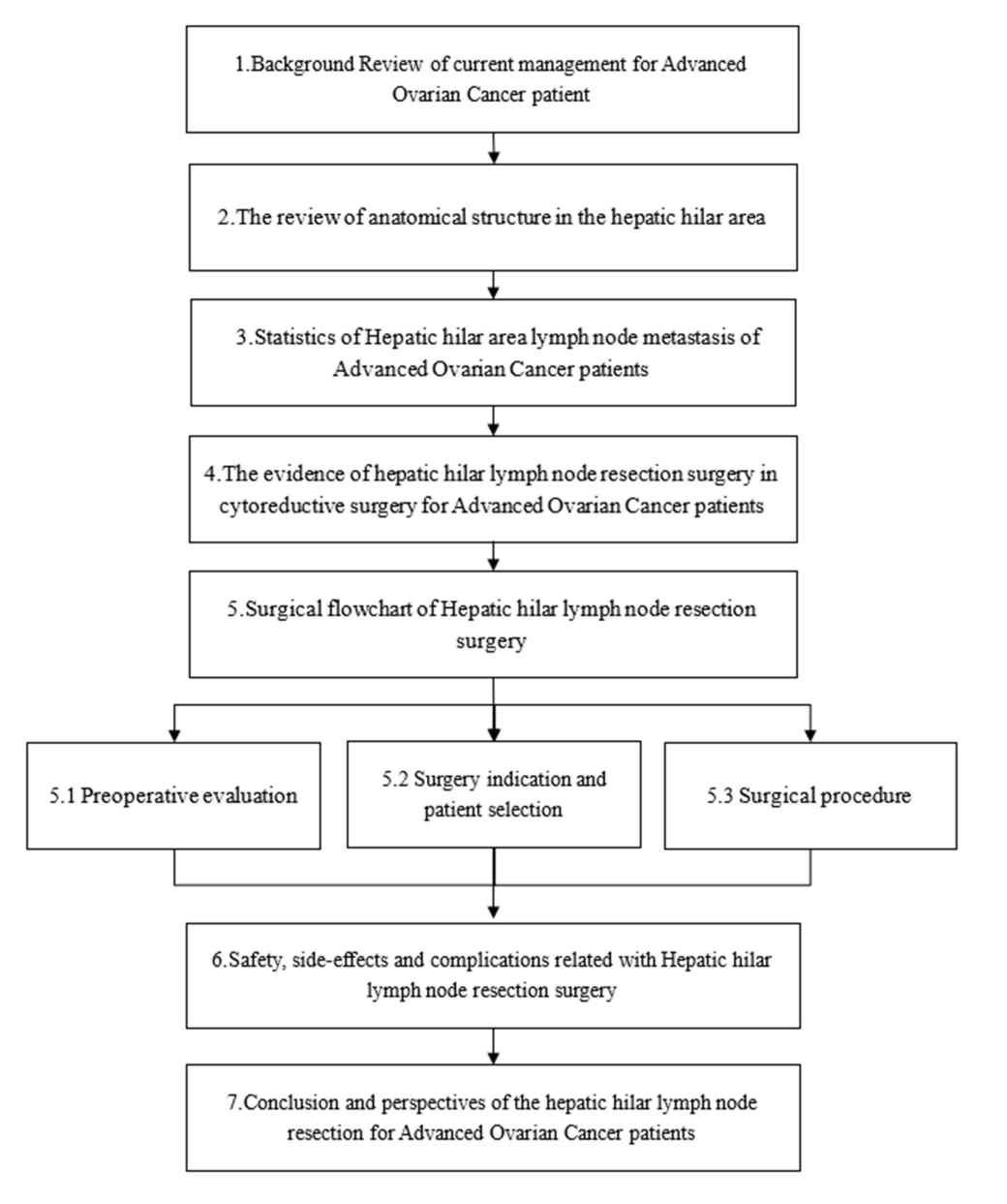
Figure I Workflow diagram of the article.

surgery on 216 patients with stage IIIC-IV ovarian cancer. During these operations, 31 cases were found to have visible lesions in the hepatic hilar area. Among which, the hepatic hilar area lesions could be completely resected in 28 cases, and 13 cases were found to have lymph node metastases in the hepatic portal area with lymph node diameter of 1.8 to 3.5 cm. These lymph nodes are distributed around the portal vein, celiac trunk, superior mesenteric artery, hepatic artery, right gastric artery and left gastric artery, etc. The prognosis of patients with hepatic hilar lymph node metastasis is worse compared to those without, and the patient's progression-free survival (PFS) is only 16 months.<sup>12</sup> Adequate preoperative imaging evaluation,