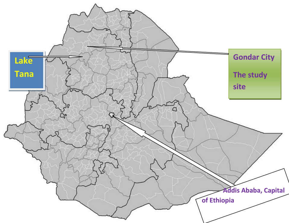
Figure 1 Gondar City, The study site.